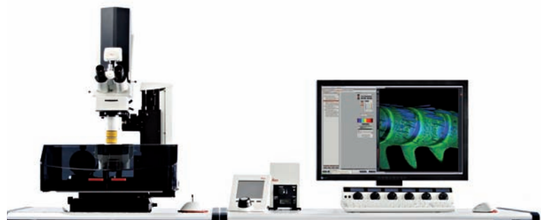
Leica TCS LSI