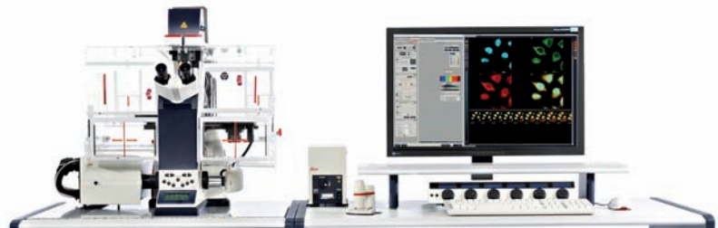
Leica TCS SPE