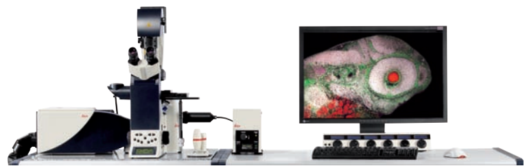
Leica TCS SP5

Amplify the power of your imaging system by HCS A and convert your confocal into a High Content Screening System. Maximum flexibility is provided for universal applications and easy automation enables efficient screening. Computer Aided Microscopy allows external system control and turns your Leica imaging system into an intelligent microscope.